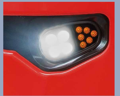
Reliable LED lighting